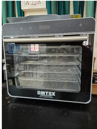
Food Dryer Machine