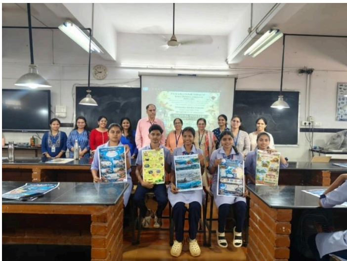
Winners of Digital Poster Presentation organized by Zoology Study Forum, Dept. of Zoology.