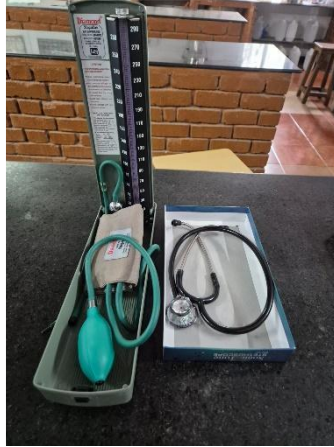
Sphygmometer with Stethoscope