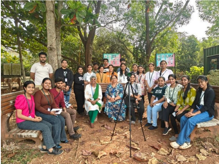
Field Visit to Karmali Wetland, Old Goa