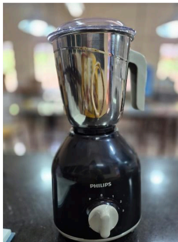
Mixture cum Grinder