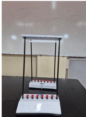
Westergrens Tube and ESR Stand