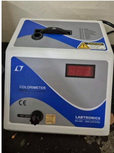
Digital Photo Colorimeter