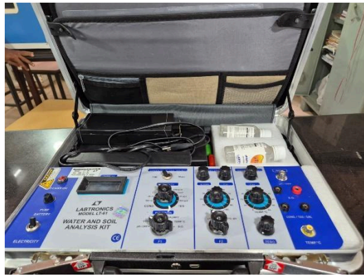
Soil Testing kit