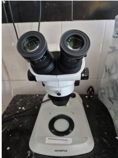
Stereo Zoom Microscope